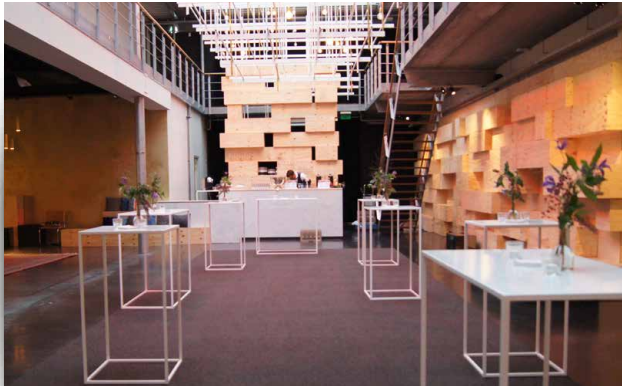
OUR COSY LOUNGE BAR WELCOME YOUR GUESTS