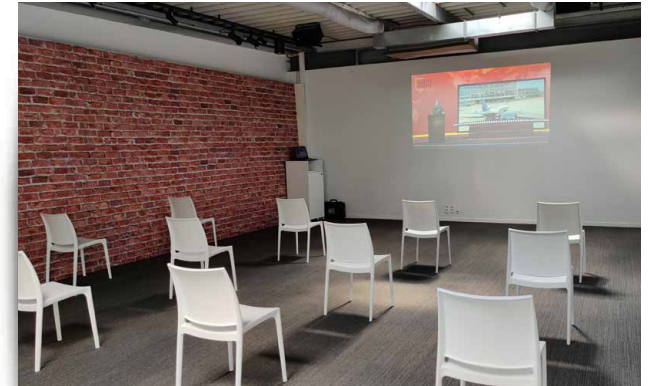
OUR BROADCAST ROOM WITH SOCIAL DISTANCING