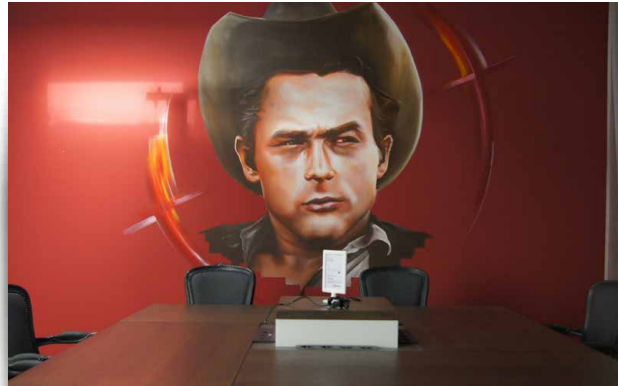
SMALL MEETING ROOM FOR MAKE UP OR REFLEXION