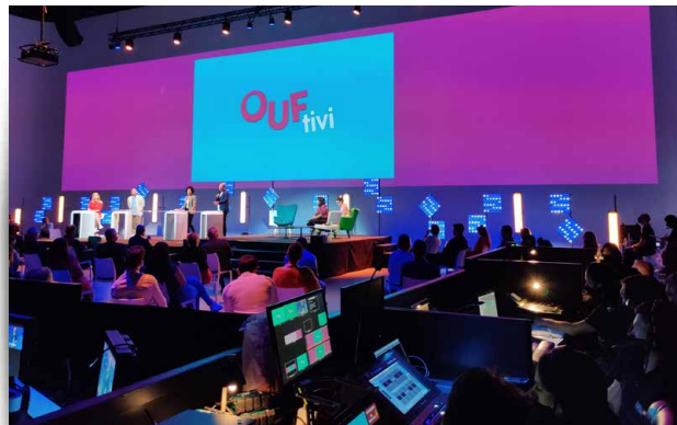
A LARGE PRE-DRIVEN FOR HYBRID EVENTS